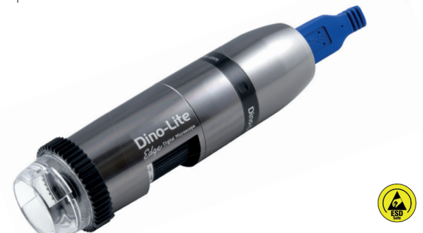
Also available AM73115MZT standard working distance, 20-220x Magnification

5 Megapixel sensor | USB 3.0 connection with up to 45fps | 10-140x magnification | Adjustable integrated polarizer | 8 white switchable white LEDs | Metal housing | Flexible LED Control (FLC) | Extensive measurement functionality | Calibrated measurements | Exchangeable caps.